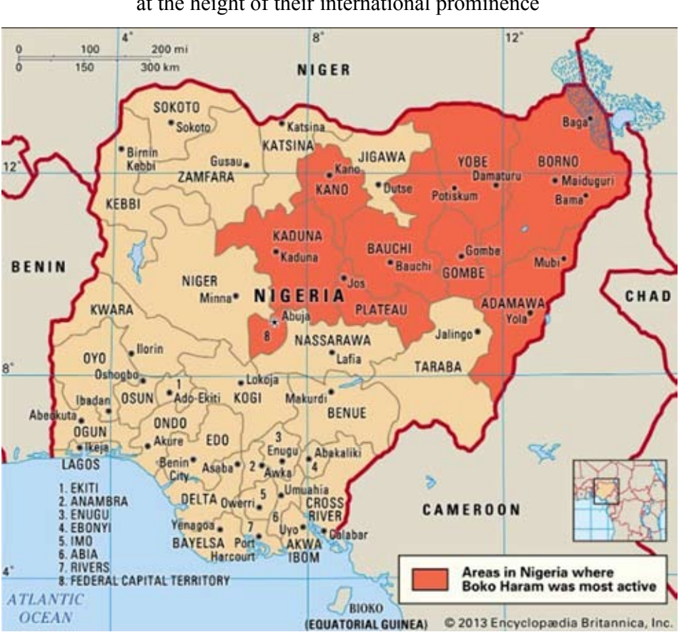
Figure 2 Main locations of Boko Haram operations as of 2013 arguably at the height of their international prominence

The map below shows the main operational areas of Boko Haram in Nigeria.