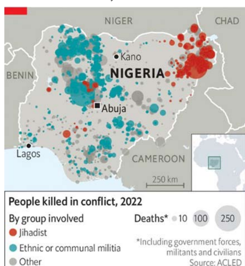
Figure 3 Areas affected by instabilities as of 2022

The diagram below shows that the country is facing unabated and on-going killings and instabilities that have the potential to disrupt economic growth; undermining the very imperative needed to curb insurgency formations.