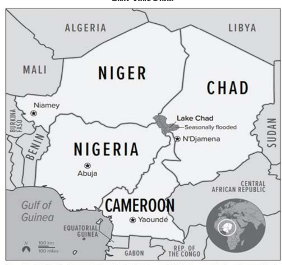
Figure 6 Lake Chad Basin

The picture below shows the location of the Lake Chad Basin area.