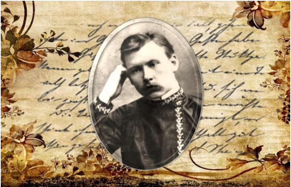
Ill. 2. Yuriy Siriy (Tyshchenko) (1880–1953), poet, publicist, one of the first translators of Tagore into Ukrainian