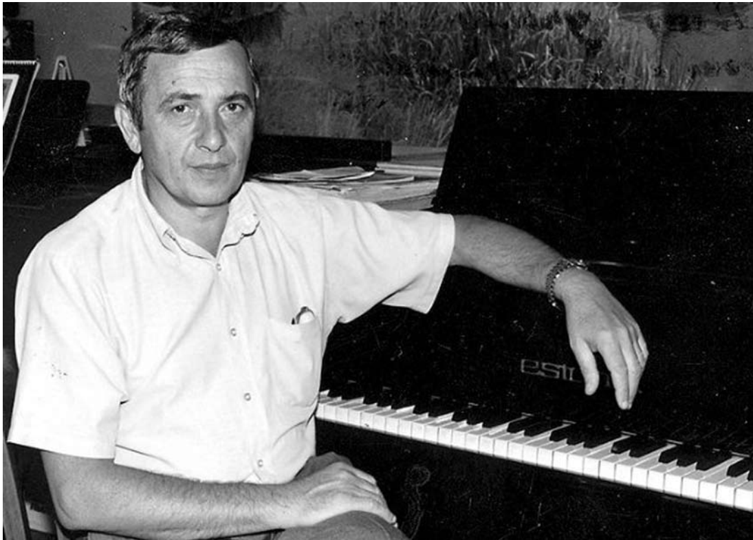
Ill. 4. Ivan Karabits (1945–2002), Ukrainian composer and music director, composed music for selected verses of Tagore