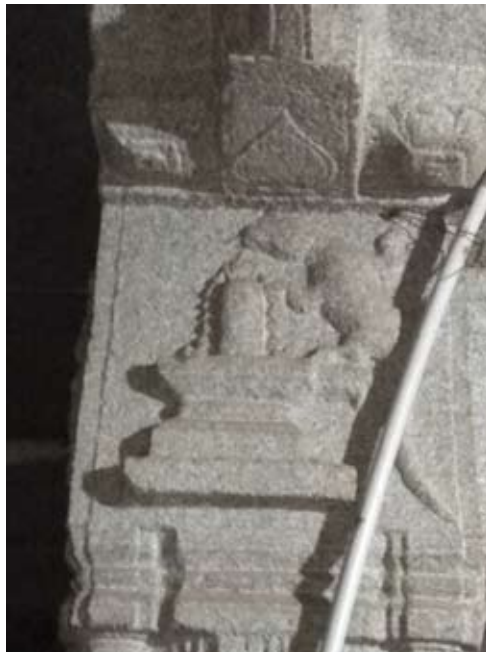
Figure 5 Śivaliṅga at Hampi.