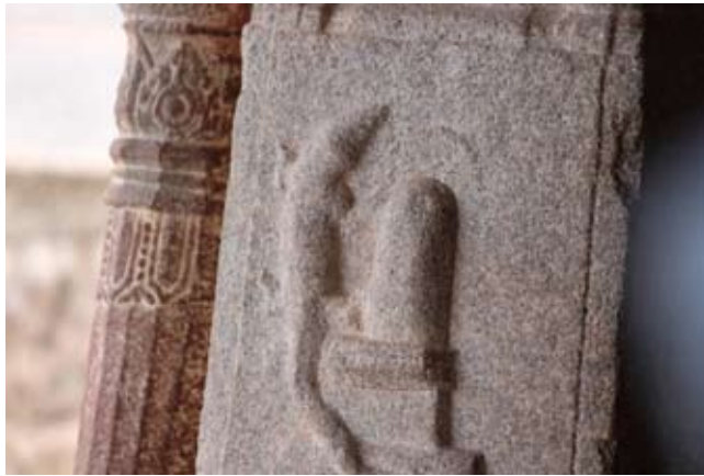
Figure 4 Śivaliṅga at Hampi.