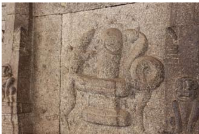
Figure 6 Śivaliṅga at Hampi.