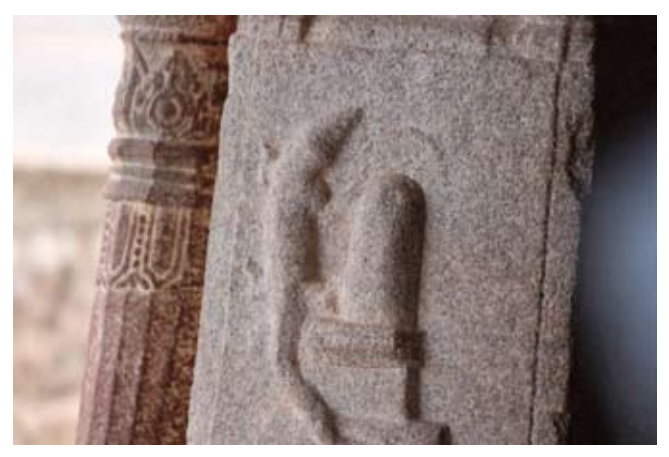
Figure 4 Śivaliṅga at Hampi.