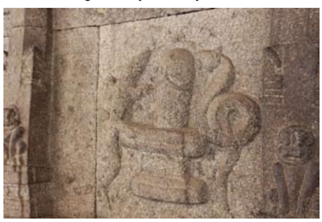
Figure 6 Śivalinga at Hampi.