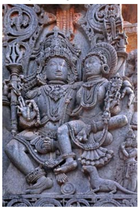
\label{eq:Figure 3} Figure \ 3 Śiva-Pārvatī and the latter riding on an iguana, Halebidu, Hoyasaleshvara temple ^{54}

1. The iconography of Gaurī<sup>51</sup> and Śriyā depicts them riding on an iguana<sup>52</sup>. This form symbolizes adamant Gaurī and her persistence to attain Śiva. The way an iguana holds its claws firmly on a surface, the same way Gaurī had the firm and austere decisiveness for attaining Śiva as the husband. This shows a lizard's symbolism to show the austerity and decisiveness and its depiction through a sculpture on one of southern India's most famous architectural marvels. Given image 1 is a depiction of an animal from the lizard's family<sup>53</sup>.