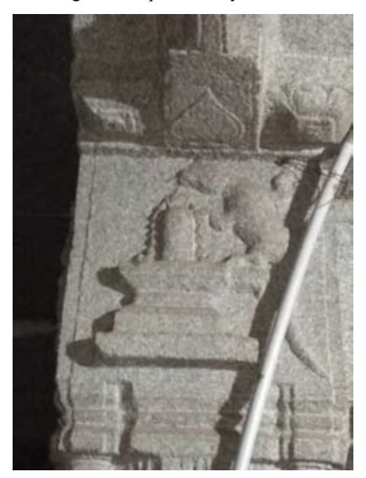
Figure 5 Śivalinga at Hampi.